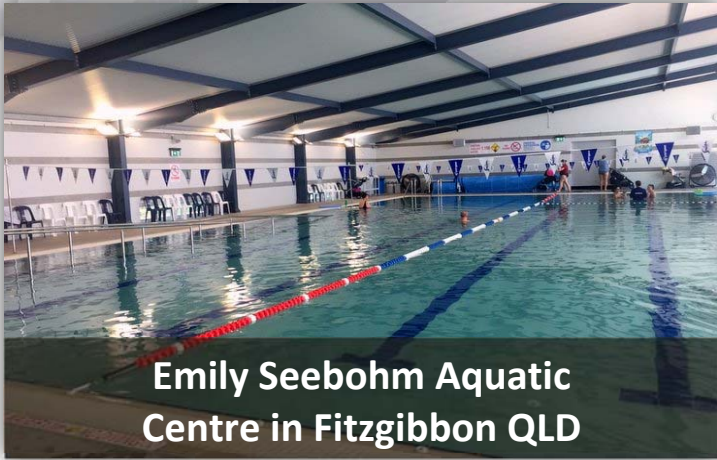
Emily Seebom Aquatic Centre in Fitzgibbon QLD