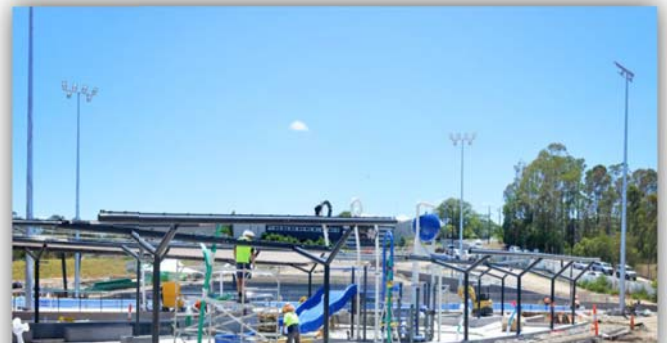
Gympie Aquatic Recreation Centre

Our Andromeda™ series of luminaires are manufactured with AL6063 marine grade aluminium and double powder coated with polyester. Materials used throughout our luminaires are chosen based on their resistance to corrosive environments, and rigorous testing ensures our products perform to expectations.