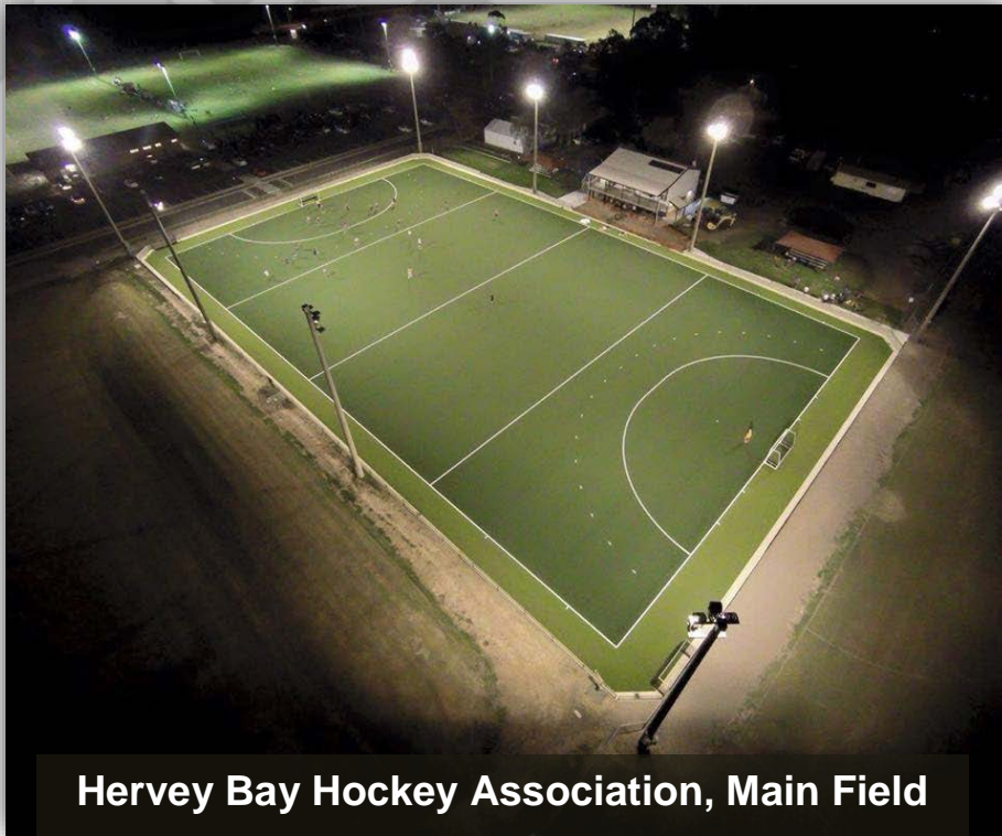
Hervey Bay Hockey Association, Main Field