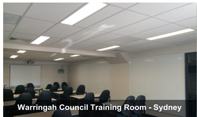
Warringah Council Training Room - Sydney

Example based on 18W T8s replaced by Corona 600mm panel operating in an office environment 30,000hrs a year using a number of variables and assumptions. Actual results may differ.