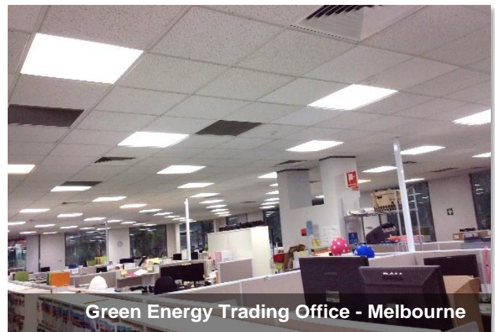
Green Energy Trading Office - Melbourne